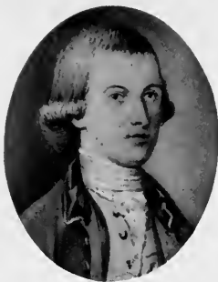
The Right Reverend William White By Charles Willson Peale Page 48